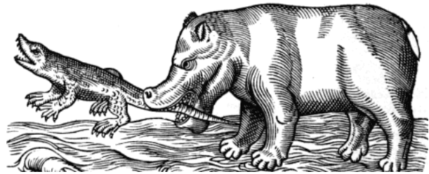
And a carnivorous hippopotamus