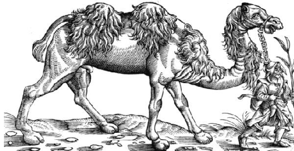
A very real (if imaginative) bactrian camel